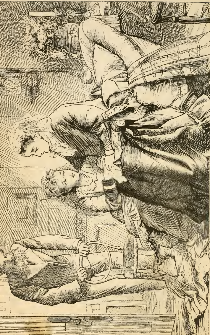
I knelt down, put my arms round her, and looked up in her face.